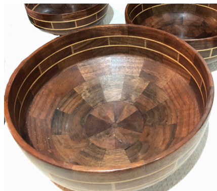
Walnut and Oak laminated bowl.