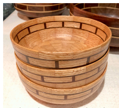
Light Oak trimmed with Walnut.