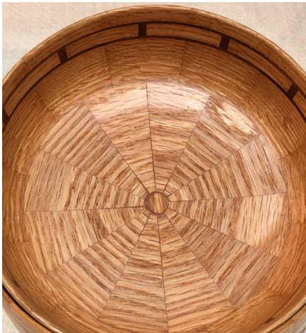
Oak & Walnut laminated bowl. Each layer takes 2 hours to dry.