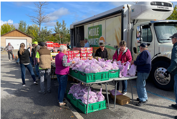
◀ Busy getting ready