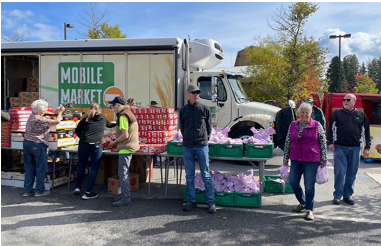
FLC and Holy Spirit volunteers at work