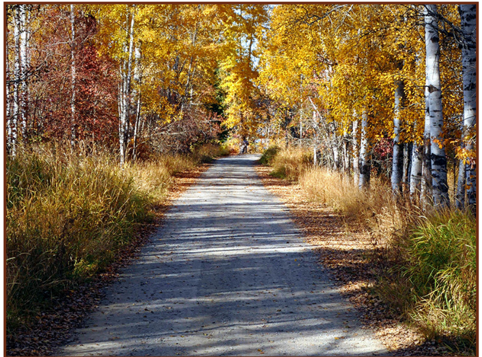
Autumn comes to Sandpoint